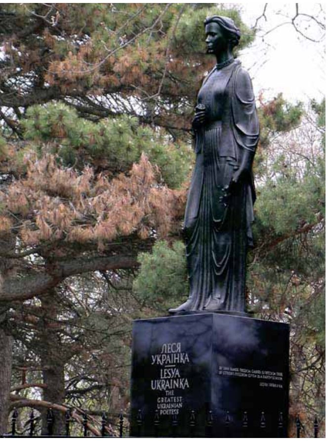
Lesya Ukrainka Monument

Originally, the sculpture stood in the open. However, inner and outer fenced enclosures have since been installed in attempts to prevent unleashed dogs from "paying their respects" to Lesya. There is still some residual odour along the outer fence and it is planned to move the dog-entry path further south.