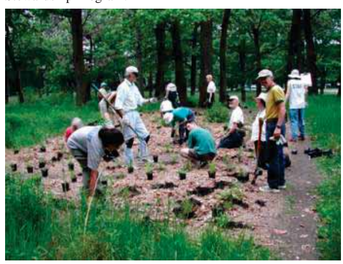
Planting with VSP, spring 2002

The restoration crew has planted native species in four different sites within the area since 2001, experimenting with different methods of planting, site preparation and species selection. Another section is planned for planting this spring on June 12th with the High Park Volunteer Stewardship Program.