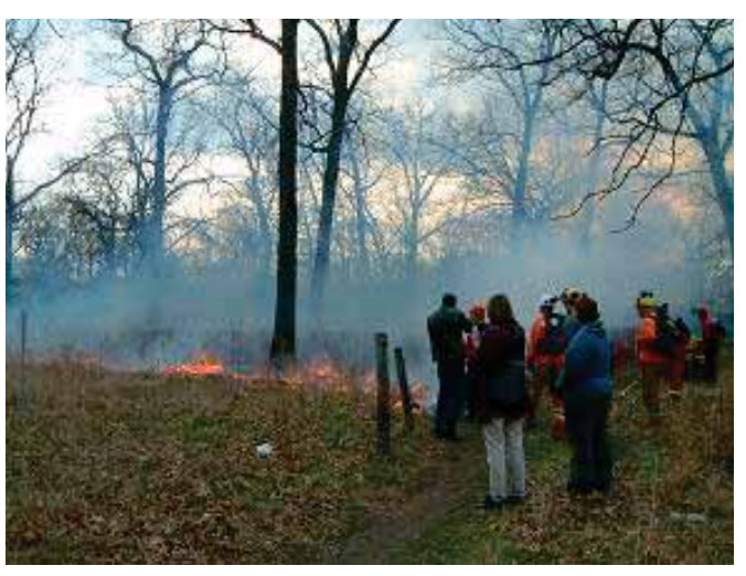
Prescribed Burn 2004 to prepare area for further planting

This site was partially planted with the VSP in spring 2002 and a fence was erected around the area to prevent trampling or vandalism. The area was also burned in spring 2004 to encourage the native plantings and to prepare the site for further planting. A mix of savannah shrubs, grasses and wildflowers will be planted, consisting only of the determined hardy native species. Future work on the site may include the addition of other species to diversify the site and prescribed burning to maintain the native plant community.